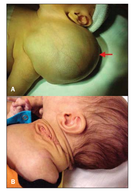
Figure 3. On A, image of the newborn 3 immediately before the surgery, demonstrating voluminous cystic hygroma at left. On B, image of the same newborn immediately after the surgery.

seling and management of these patients<sup>(1)</sup>. Lymphangiomas are congenital malformations of the lymphatic system caused by a failure in the drainage from the primordial lymphatic sac<sup>(1,3)</sup>. This failure leads to an