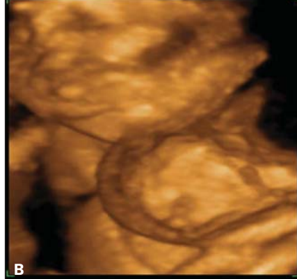
Figure 1. Sonographic findings of cystic hygromas. On A, axial US demonstrating heterogeneous septate lesion (arrows), affecting the cervical region (fetus 2), predominantly at left. On B, 3D US image of the same fetus demonstrating cervical mass.