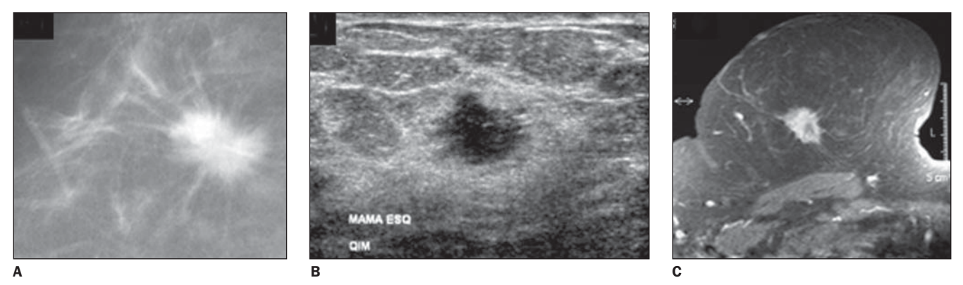
Figure 3. Examples of nodules classified as BI-RADS category 5. A: Mammographic image showing a hyperdense, irregular nodule, with spiculated margins B: Sonographic image showing hypoechoic, irregular nodule with spiculated margins, non-parallel orientation and without posterior acoustic shadowing. C: Contrast enhanced magnetic resonance image showing an ovoid nodule with irregular margins and ring-like enhancement.

100% for NPV, allowing us to conclude that the system may be useful in a conservative management of alterations classified as BI-RADS category 3.