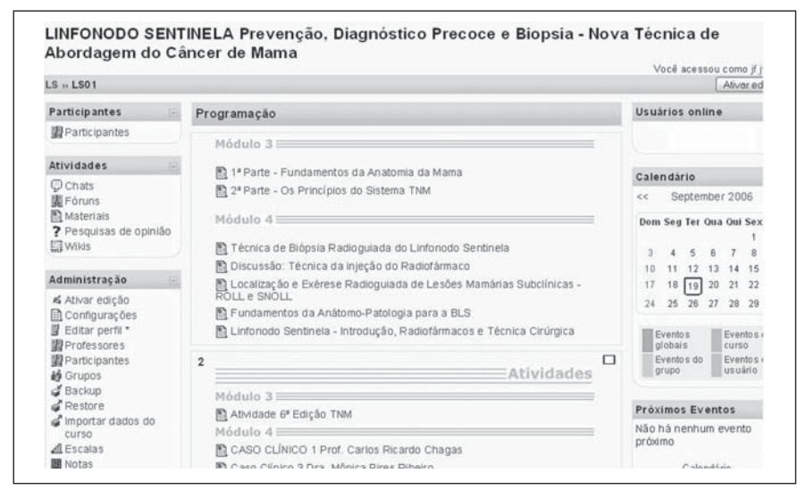
Figure 1. Instructional material made available to students at virtual learning environment.

After publicizing during the Brazilian Congress of Mastology, in September/