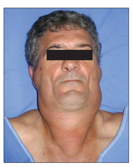
Figure 1. Preoperative appearance of a patient with Madelung's disease. Presence of poorly defined, hardened subcutaneous masses in the anterior and lateral cervical regions.

A male, white, 43-year-old patient, was referred to the Service of Head & Neck Surgery of Hospital Universitário de Santa Maria, with a ten-year history of an expansive cervical lesion. The neck tumors presented slow growth and progressive increase. Dyspnea, dysphagia or hoarseness were not reported. The current complaint was a "tightness" sensation in the infrahyoid region over the past five months. The patient was not obese, previously healthy and was alcoholic and smoker for fifteen years. At physical examination, the patient presented with good general condition, with poorly defined masses, firm at palpation, located in the subcutaneous tissue on the anterior and lateral cervical regions