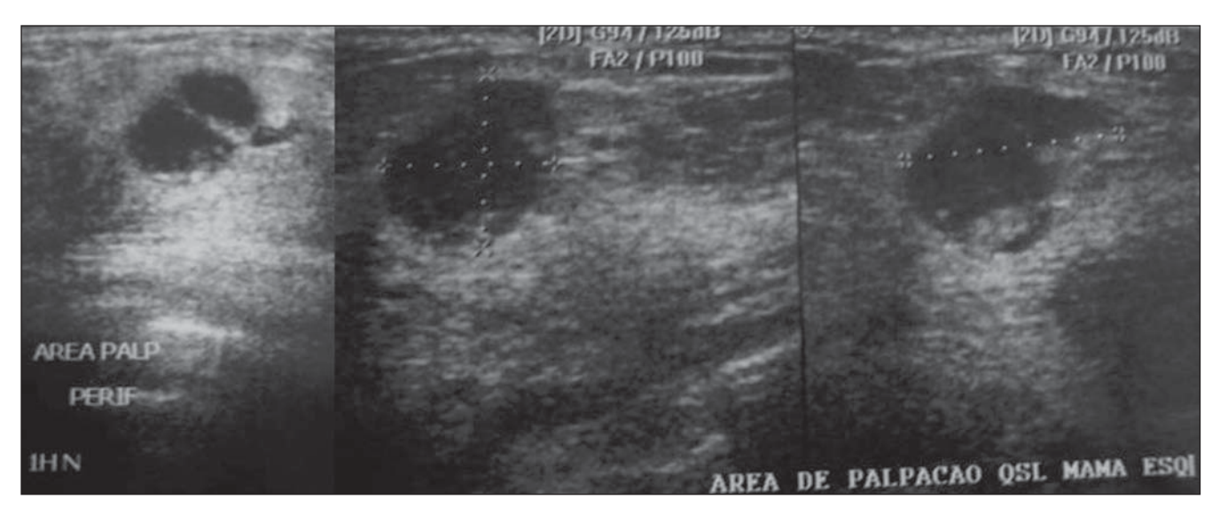
Figure 2. Breast ultrasonography demonstrating a complex cyst with solid components and thickened septa located in the superolateral quadrant of the left breast, peripherically to the papilla, measuring 13 \times 8 mm, in a region of palpation at physical examination.

PET/CT can significantly change the assessment of the disease extent in ovarian cancer patients – including cases of recur-