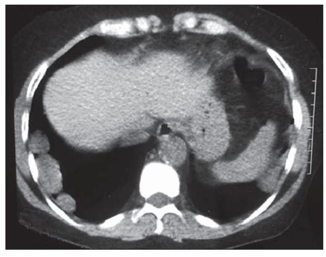
Figure 3. Non contrast-enhanced, axial computed tomography demonstrating three hypodense, round-shaped and well delimited juxtapleural pulmonary nodules at right and one at left.