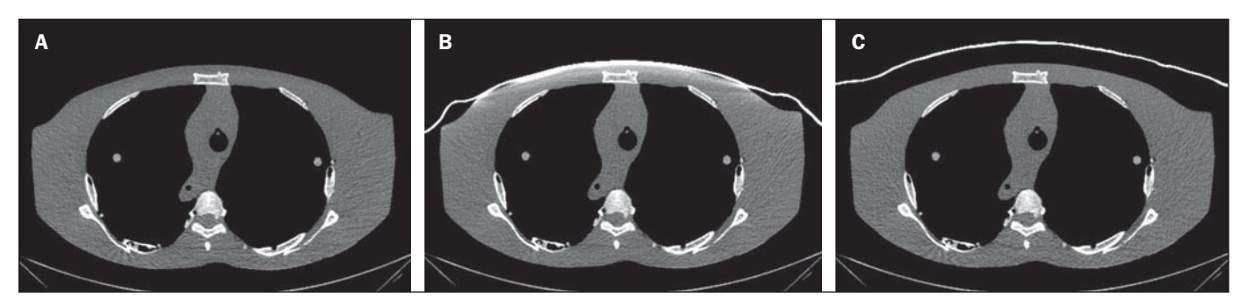
Figure 2. Comparison between axial sections on a single region. A: Reference image without the shielding. B: Image of the shielding placed directly on the phantom. C: Image with the shielding and use of a spacer.