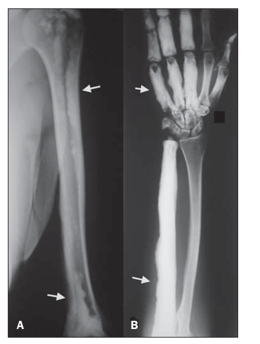
Figure 1. Radiographic images of left arm (A), forearm and hand (B) demonstrating cortical hyperostosis along the bone axis resembling "melted candle wax" (arrows).

Plain radiography of the affected limb and hip demonstrated alterations typical of melorheostosis, such as unilateral cortical hyperostosis along the bone axis resembling "melted candle wax" involving only one body segment (left hemibody) and extending from the humerus up to the hand bones (Figure 1). Similar alterations were also observed in the iliac bone at left (Figure 2)