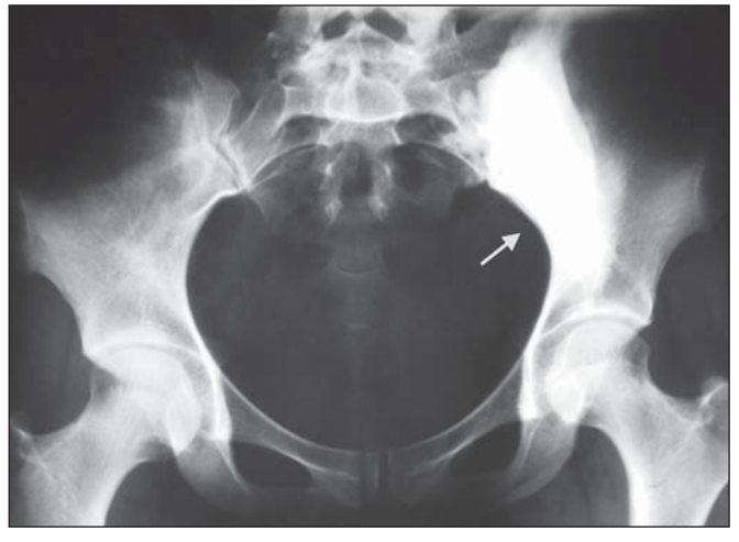
Figure 2. Radiographic image of hip shows iliac and sacrum hyperostosis (arrow), at left, with the same finding observed in the upper limb of the patient.

The disease distribution is peculiar and typically affects only one side of the body, and may be either mono- or polyostotic, in