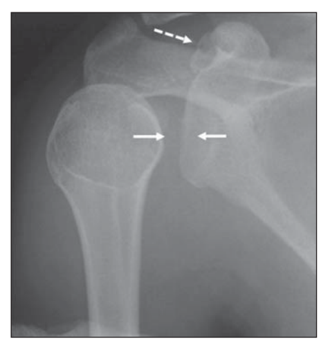
Figure 1. Radiography of right shoulder. Anteroposterior view showing glenohumeral joint space widening (continuous arrows). The humerus presented with internal rotation. The dashed arrow indicates fracture of the coracoid process.

Difficulty or incapacity to reduce GHJ luxation is not common<sup>(1–3)</sup>. Irreducible GHJ luxation may be related to bone tissue or soft tissues interposition<sup>(1,2,4,6–10)</sup>. Amongst the causes associated with soft tissues interposition, one can