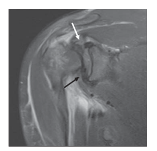
Figure 3. MRI, coronal section, intermediate weighting. The arrows identify rotator cuff stumps interposition between the glenoid and the humerus. The white arrow indicates the supraspinatus tendon and the black arrow shows the subscapularis tendon.