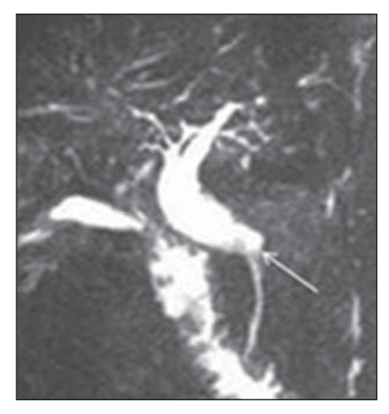
Figure 3. Magnetic resonance cholangiography showing bile duct dilatation up to the intrapancreatic common bile duct (arrow).