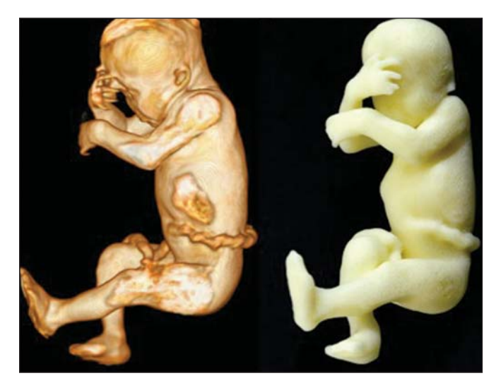
Figure 4B. Whole-body 3D reconstruction from the MRI and physical model.

real time and can be frozen during movement. However, in some cases, the lower resolution of contrast ultrasound created difficulties due to the limits of the gray scale. The quality of the process is directly associated with the accuracy of the mathematical data that will be used in order to generate the physical model. The images are acquired in slices, which are superimposed for the construction of the model.