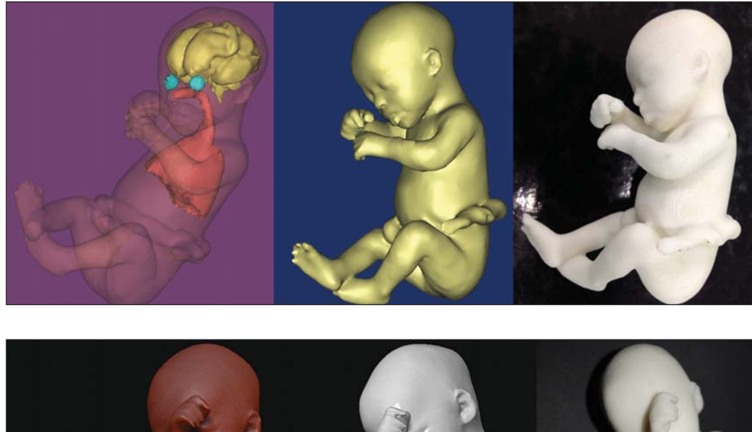
Figure 2. Case 18. Fetus with trisomy 21. Whole-body virtual and physical model obtained by MRI.