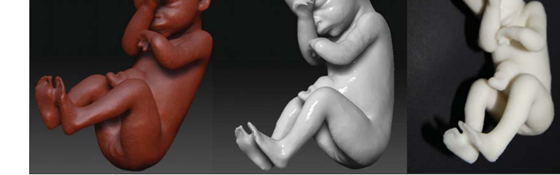
Figure 3. Case 29. Fetus with left radial agenesis and omphalocele. Whole-body virtual and physical model obtained by MRI.

Werner et al.<sup>(10)</sup> introduced the use of physical models in fetal disease research, an area in which studies involving digital (3D) modeling are scarce<sup>(11–14)</sup>. The results suggest a new possibility in the interaction between the parents and the fetus during prenatal monitoring, physically recreating