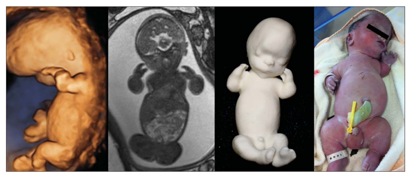
Figure 1. Case 26. Fetus with thanatophoric dysplasia. Ultrasound, MRI, physical model, and stillborn fetus.