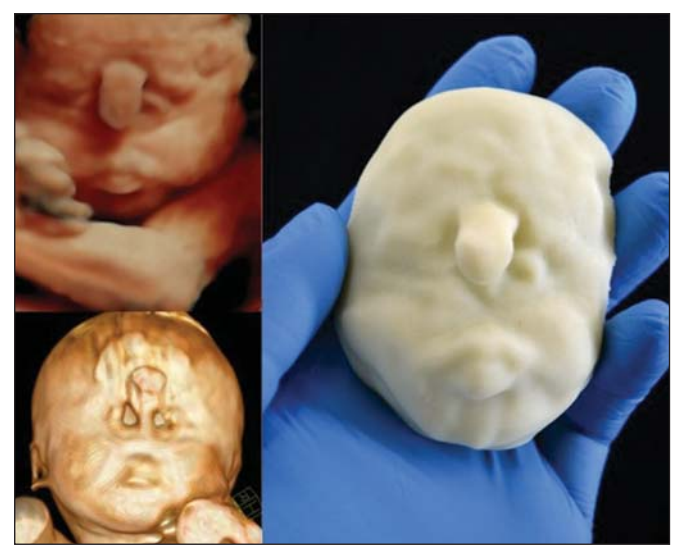
Figure 4. Case 16. A: Fetus at the 25th week of gestation, showing alobar holoprosencephaly and proboscis. Face obtained by 3D-US/3D MRI, and physical model obtained from the ultrasound data.

the acquisition of images constituted one of the main difficulties, especially in the MRI evaluation. This problem is minimized in ultrasound, because the image is acquired in