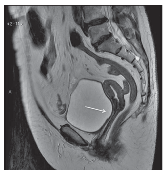
Figure 1. MRI scan requested for the assessment of pelvic tumor recurrence in a patient with cervical cancer after cone biopsy. T2-weighted sagittal section showing the uterus in anteversion, midline, with signs of surgical manipulation of the colon, and a diffuse reduction of T2 signal intensity.

Of the 1060 patients evaluated, 813 (76.7%) presented an appropriate indication for MRI, according to the ACR criteria. The main indications observed were evaluation of tumor recurrence after resection, in 275 (25.9%), as shown in Figure 1; detection and staging of gynecologic neoplasms, in 247 (23.3%), as shown in Figure 2; and evaluation of