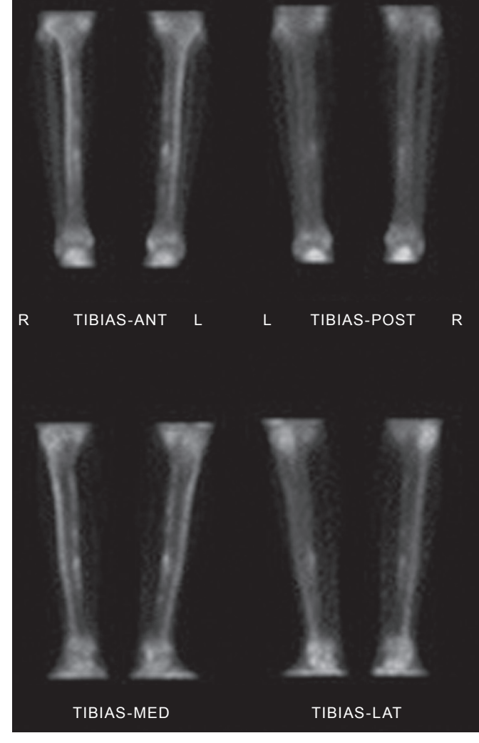
Figure 1. Quantitative analysis of bone scintigraphy.

We did not use any other treatment (e.g., pneumatic support, insole treatment, and physiotherapy) that could