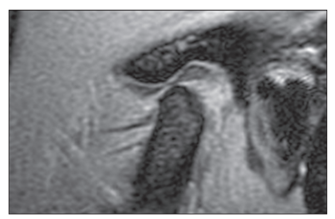
Figure 1. T1-weighted central sagittal MRI scan of the TMJ. In the closedmouth position, the articular disc is biconcave and in the normal position in relation to the condyle.

On the basis of the MRI findings, the articular disc was classified as follows: normal function-disc location normal on closed- and open-mouth images (Figure 1); disc displacement with reduction (DDWR)-disc location displaced on closed-mouth images but normal on open-mouth images (Figure 2); disc displacement without reduction (DDWoR)-disc location displaced on closed- and openmouth images (Figure 3); posterior disc displacementposterior band of the disc clearly in contact with the bilaminar zone; lateral disc displacement-disc displaced laterally in relation to the condyle; or medial disc displacement-disc displaced medially in relation to the condyle. The condyle was considered degenerated when it exhibited osteophytes, flattening, surface erosion, a subcortical cvst, or sclerosis. Glenoid fossa degeneration and changes in the shape of the articular eminence were characterized by articular surface flattening, surface erosion, or subcortical sclerosis. Condylar translation was evaluated on open-