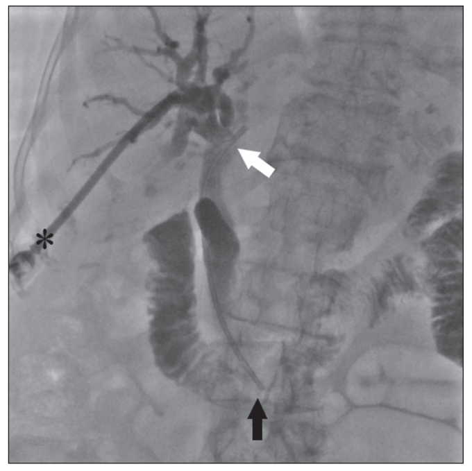
Figure 4. After removing the delivery system, we inject a small amount of diluted iodized contrast through the introducer (asterisk) and conduct a post-procedure cholangiography. That allows us to evaluate the patency of the stent, as well as its positioning, with its proximal end at the level of the common hepatic duct (white arrow) and its distal end at the level of the duode-num (black arrow).

(Figure 4). After the stent delivery system has been removed, the stent can no longer be repositioned. As part of the protocol at our facility, a follow-up abdominal X-ray is taken 24 h after the procedure in order to verify that the intrabiliary contrast has been completely eliminated. In all cases of lesions suspected of malignancy, cholangiobiopsies are performed with the technique described by Nunes et al.<sup>(6)</sup>.