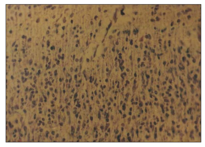
Figure 2. Photomicrography of the encephalic region of a 17-day control fetus. An intact cerebral tissue can be observed. (Hematoxilin-eosin; ten-fold magnification).

The description of the effect of X-irradiation during the pre-implantation period as "everything or nothing"<sup>(3)</sup> was confirmed in the present study, considering that the embryos developed normally up to the 17th gestational day, and no follow-up loss was recorded. Vos<sup>(3)</sup> also reports that the primary effect of X-ray exposure during the organogenesis phase is the development of malformations. Nevertheless, in the present study, the control group was irradiated during the organogenesis phase and no malformation could be evidenced. However, loss of nervous tissue architecture and hemorrhage probably would have resulted in later developmental disorders.