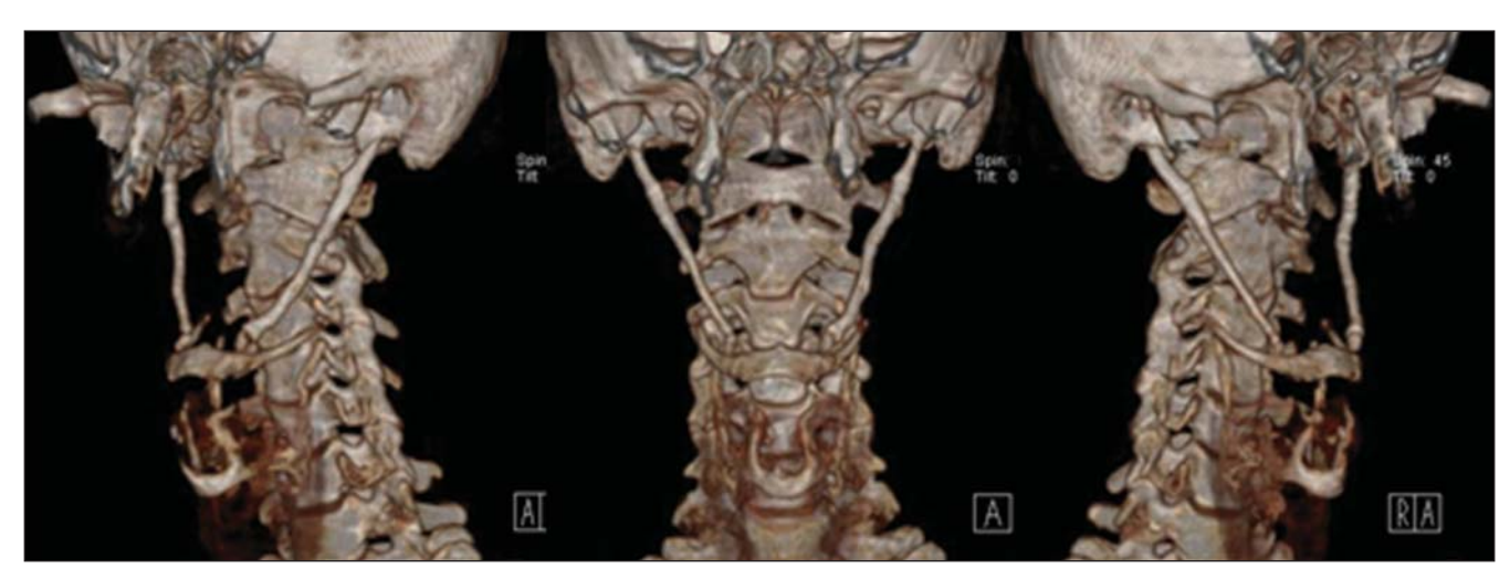
Figure 3. Computed tomography image with 3D reconstruction of the cervical spine.